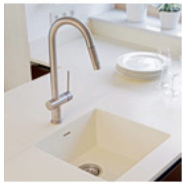
In our catalogues, you may select one of our full Corian<sup>®</sup> sinks with fashionable square or classic rounded angles.

When you make Corian<sup>®</sup> sinks an integral part of your kitchen design, you get a sensational look and outstanding practicality. Durable and non-porous, Corian<sup>®</sup> sinks are as easy to maintain as they are pleasing to the eye. You can choose from an extensive range of sink styles - each showcasing the materials' extraordinary design flexibility - and install them either as singles or in combination to meet the aesthetic and functional needs of your kitchen.