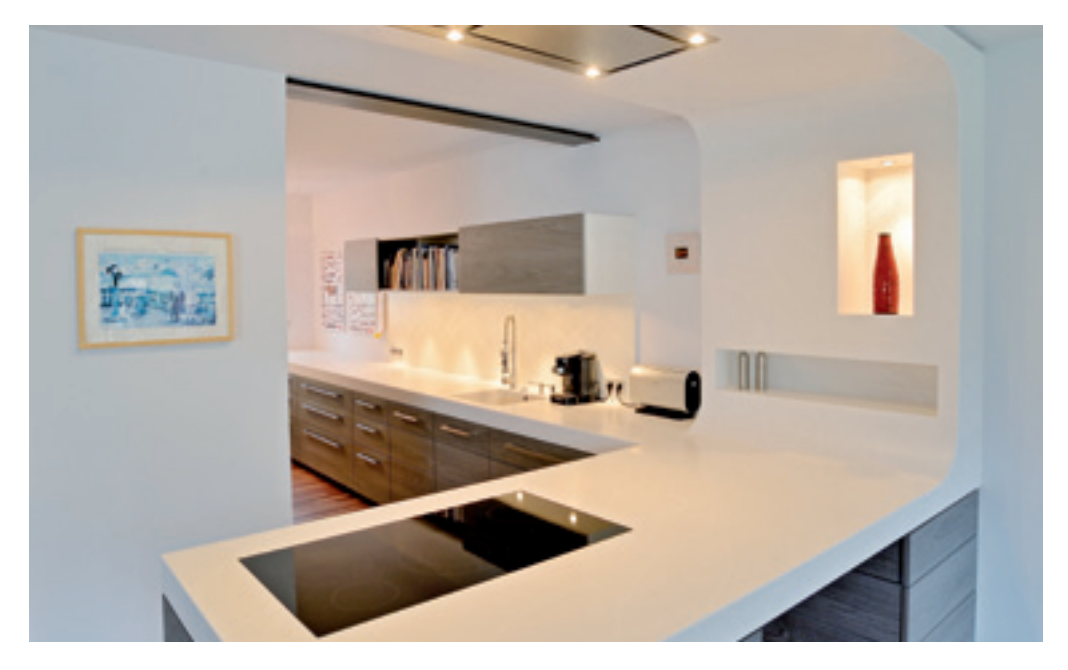
No matter how spacious or compact your kitchen, Corian® lends an endless elegance and a silky, seductive touch.