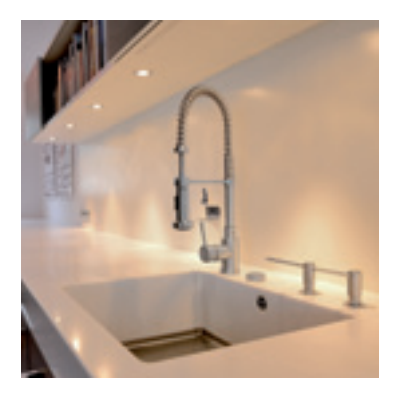
Or you may choose a Corian<sup>®</sup> sink with a stainless steel base - available in the entire range of Corian<sup>®</sup> colours - to match your worktop, creating a uniform look and an endless flow of colour.

These are available in a large or smaller shape, in a choice of five colours (Designer White, Glacier White, Cameo White, Bone or Vanilla).